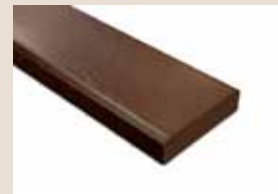
BL1 L: 90mm, TH: 22 mm