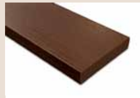
BL8 L: 120 mm, TH: 22 mm