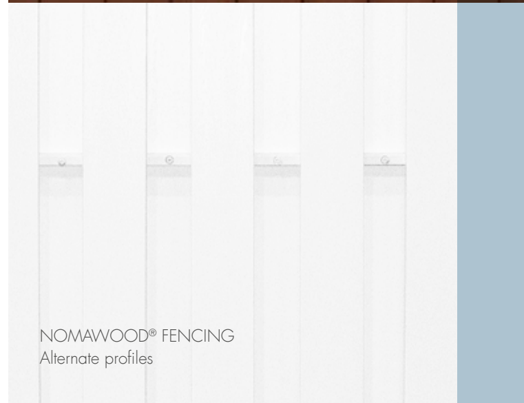
NOMAWOOD® FENCING Alternate profiles