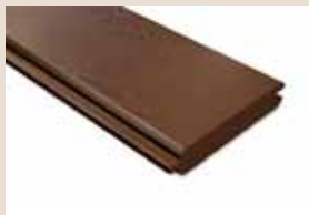
BL4 L: 116 mm, TH: 22 mm

NOMAWOOD® offers a multitude of panels for very diverse applications (garden fences, gates, eaves, exterior furniture, ...)