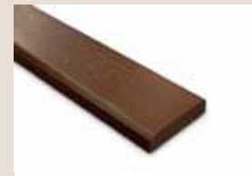
BL2 L: 70mm, TH: 17 mm