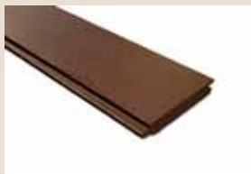
TGF2 L: 92,5 mm, TH: 15 mm