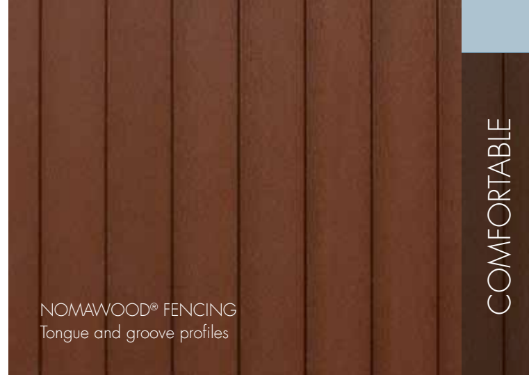
NOMAWOOD® FENCING Tongue and groove profiles